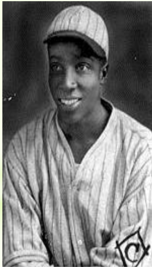
(Baseball) Jackie Robinson (Baseball) Player